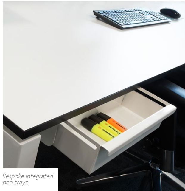
Bespoke integrated pen trays