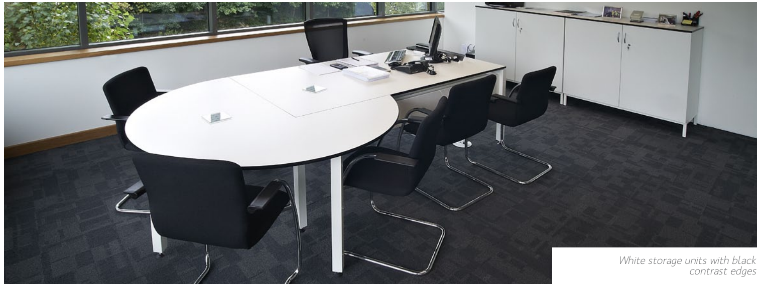
White storage units with black contrast edges