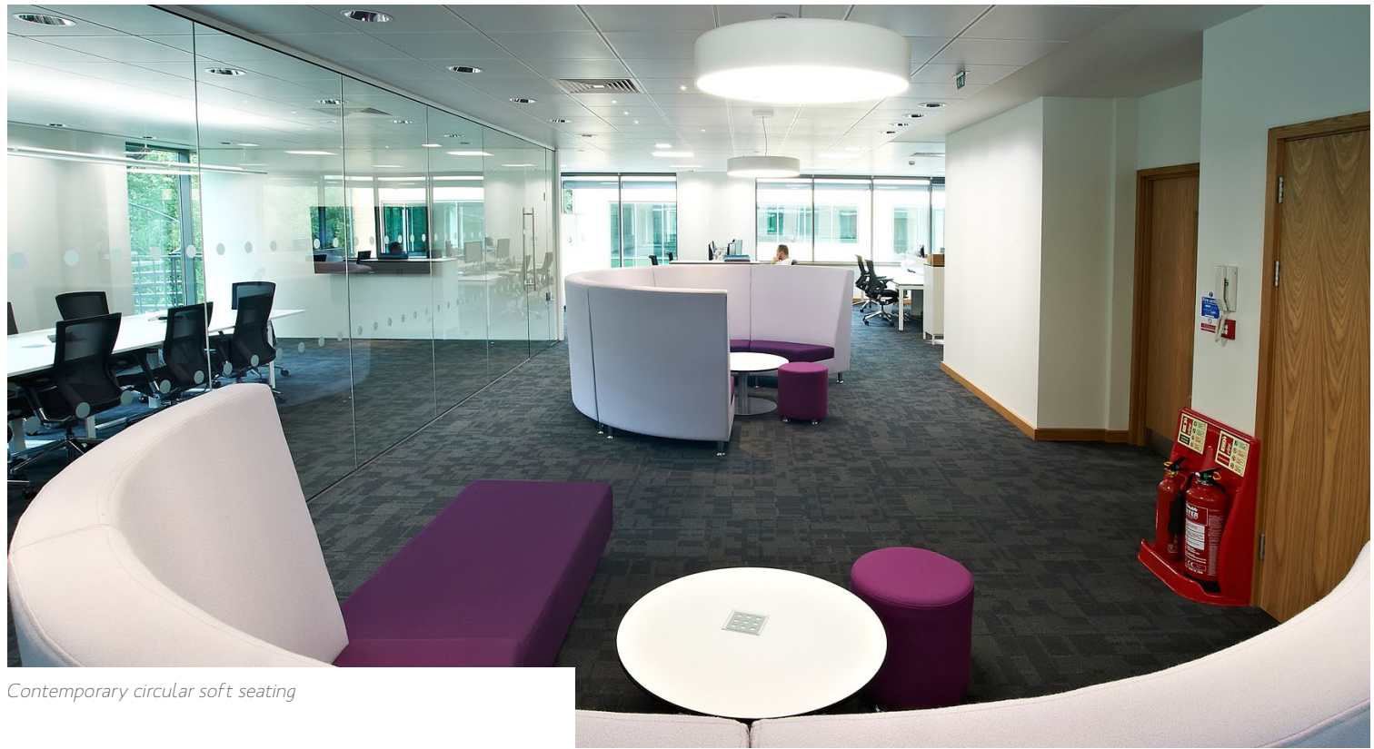
Contemporary circular soft seating